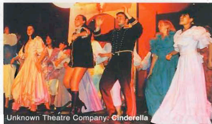
Unknown Theatre Company: Cinderella