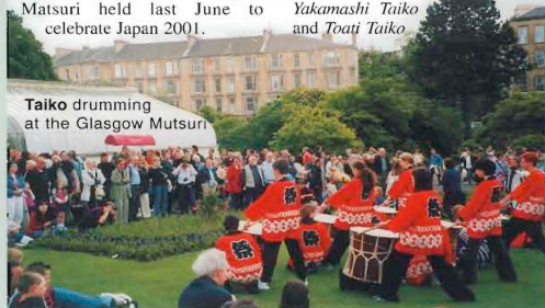
Taiko drumming at the Glasgow Matsuri

One of the highlights of this year's Matsuri was a taiko performance by pupils from Clevedon Secondary School. Last year the school had only one taiko band, Psycho Taiko , but this year it had three, including Yakamashi Taiko and Toati Taiko .