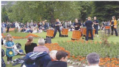
Festive focus: Glasgow Botanic Gardens provided the perfect setting for the festival

Now an annual event, the Glasgow Matsuri originated as a Japan 2001 project in conjunction with Glasgow's West End Festival, and was so successful that another event, the Hina Matsuri, was organised in March 2002 at the close of Japan 2001. Shortly afterwards, a voluntary organisation, Japanese Matsuri for Glasgow (JMG) was established in order to hold an annual festival to promote Japanese culture and heritage, and to enhance wide community involvement