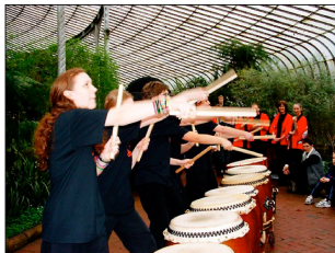
Cleveden Secondary Pupils